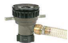
Style 888 Self-Educting Nozzle (750 GPM)