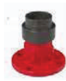
Style 190 Direct Mount Flange