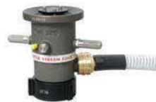
Style 887 Self-Educting Nozzle (500 GPM)