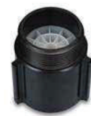
Style 119 Stream Shaper